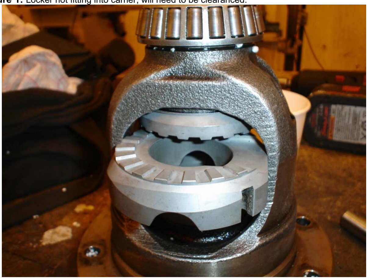
Figure 1: Locker not fitting into carrier; will need to be clearanced.